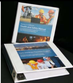
OSHA Safety Manual and ISNetworld® – 3 rd Party Pre-Qualification Manual